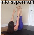
2 v-up roll over into superman